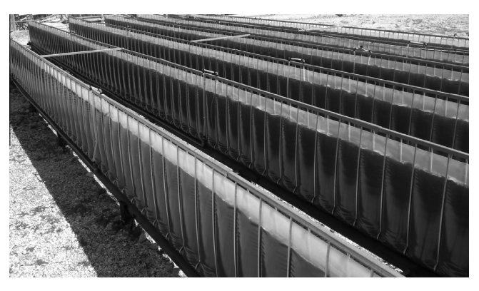
Fig. 2. GWP-II photobioreactor at the F&M facility in Sesto Fiorentino (Italy).

by F&M in FP7 EU projects (BIOFAT and FUEL4ME) and for the commercial production of microalgae biomass at Microalghe Camporosso S.r.l. It is also used by companies in several R&D projects (in Chile, Portugal, Sweden, Saudi Arabia, Italy). The original GWP design, the GWP-I [10], has been improved in order to reduce its embodied energy and cost [25]. In the new design (GWP-II) (Fig. 2) the plastic culture chamber is contained by a number of vertical stainless-steel uprights directly driven into a wooden base and connected at the top by a horizontal stainless-steel bar so as to form a unique frame [25]. The removal of the grids and the reduction of the culture chamber height from 1 to 0.7 m have allowed the construction of a much lighter metal frame, decreasing in this way the energy associated with reactor materials and reactor cost. The culture chamber is made of a flexible, PAR-transparent (>90%),