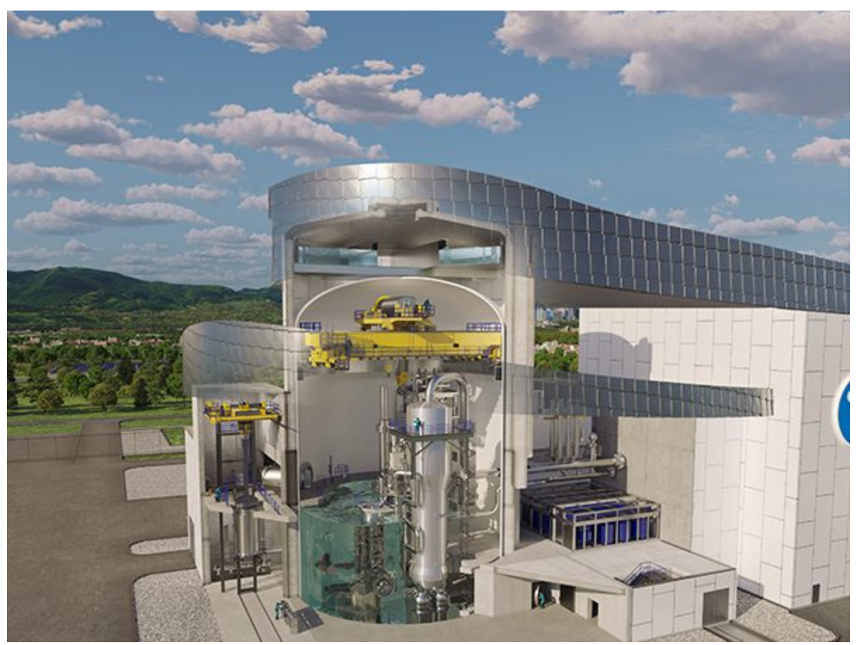
A "peel-away" view of Westinghouse's newly launched AP300 reactor.

What makes the new offering distinctive, however, is a technology with a miniature footprint that leverages decades of established development and operating experience, Durham said. "Most people don't realize that the AP1000's nuclear island is already considerably smaller than some SMRs that are currently being developed and marketed by competitors," he noted. Compared to the AP1000, which was designed around a conventional two-loop, two-steam generator primary system configuration, the AP300 features a single loop.