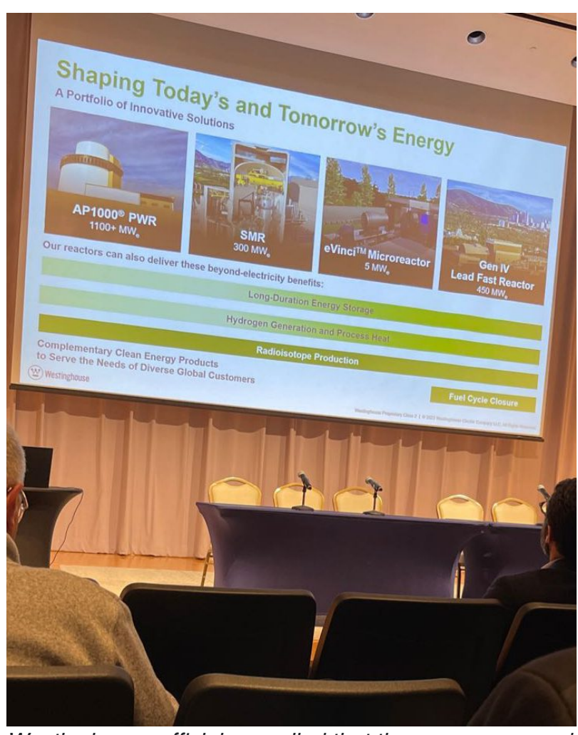
Westinghouse officials unveiled that the company was developing a 300-MW small modular reactor at the ASME Conference for Advanced Reactor Deployment in College Station, Texas, in

Westinghouse is in tandem spearheading development of a 450-MWe lead fast reactor (LFR) alongside Ansaldo Energia, she noted. The Generation IV concept's high heat capabilities could generate process heat for myriad applications, including hydrogen generation, and it is ideally suited to enable long-duration energy storage, she said.