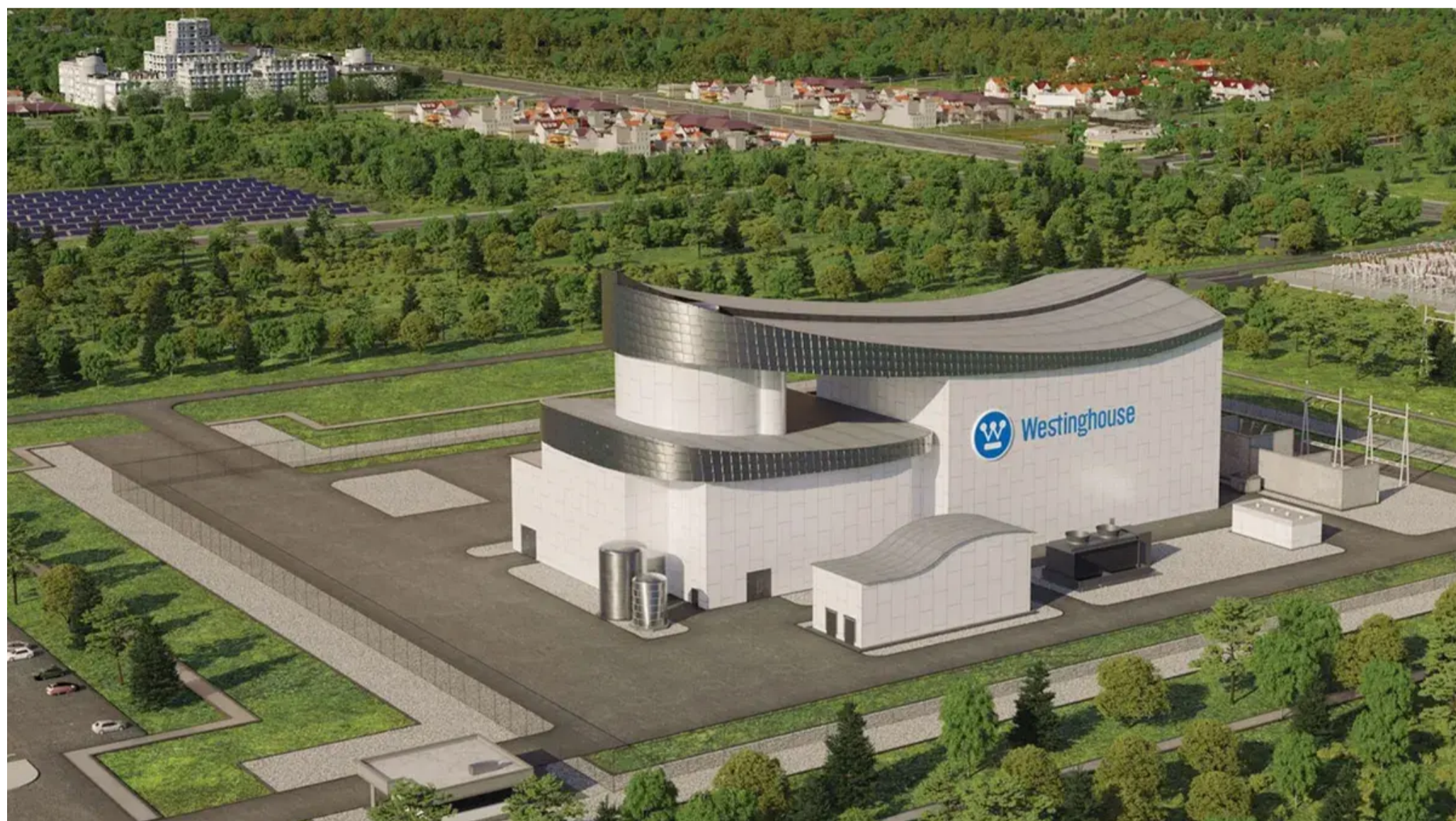
Westinghouse unveils AP300, a small modular reactor for mid-sized nuclear technology.