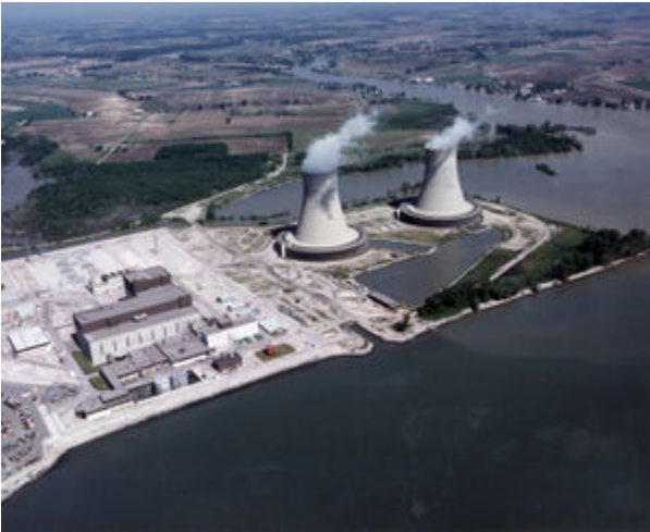
Figure 1. The Enrico Fermi Nuclear Generating Station in Newport, Michigan operates by use of a boiling water reactor. [1]

Boiling water reactors (BWR) are a type of nuclear reactor that use light water (ordinary water, as opposed to heavy water ) as their coolant and neutron moderator . They are the second most used reactor for nuclear power generation in the world, next to the pressurized water reactor (PWR)—with 75 in operation as of 2018. [2] Figure 2 graphs the percentage of various types of reactors worldwide and the chart details the number of each.