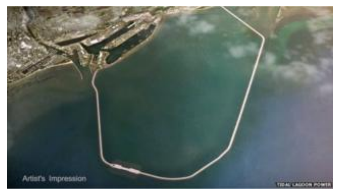
Tidal Lagoon Power

In Swansea, the lagoon wall will stretch more than five miles and reach more than two miles out to sea