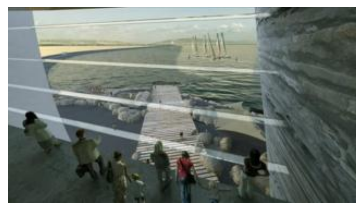
Tidal Lagoon Power

Some anglers fears the lagoon might affect migrating fish, but planners say the new sea wall would act as a reef