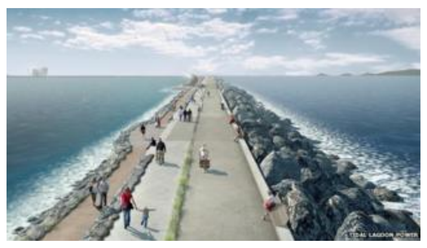
Tidal Lagoon Power

Some anglers fears the lagoon might affect migrating fish, but planners say the new sea wall would act as a reef