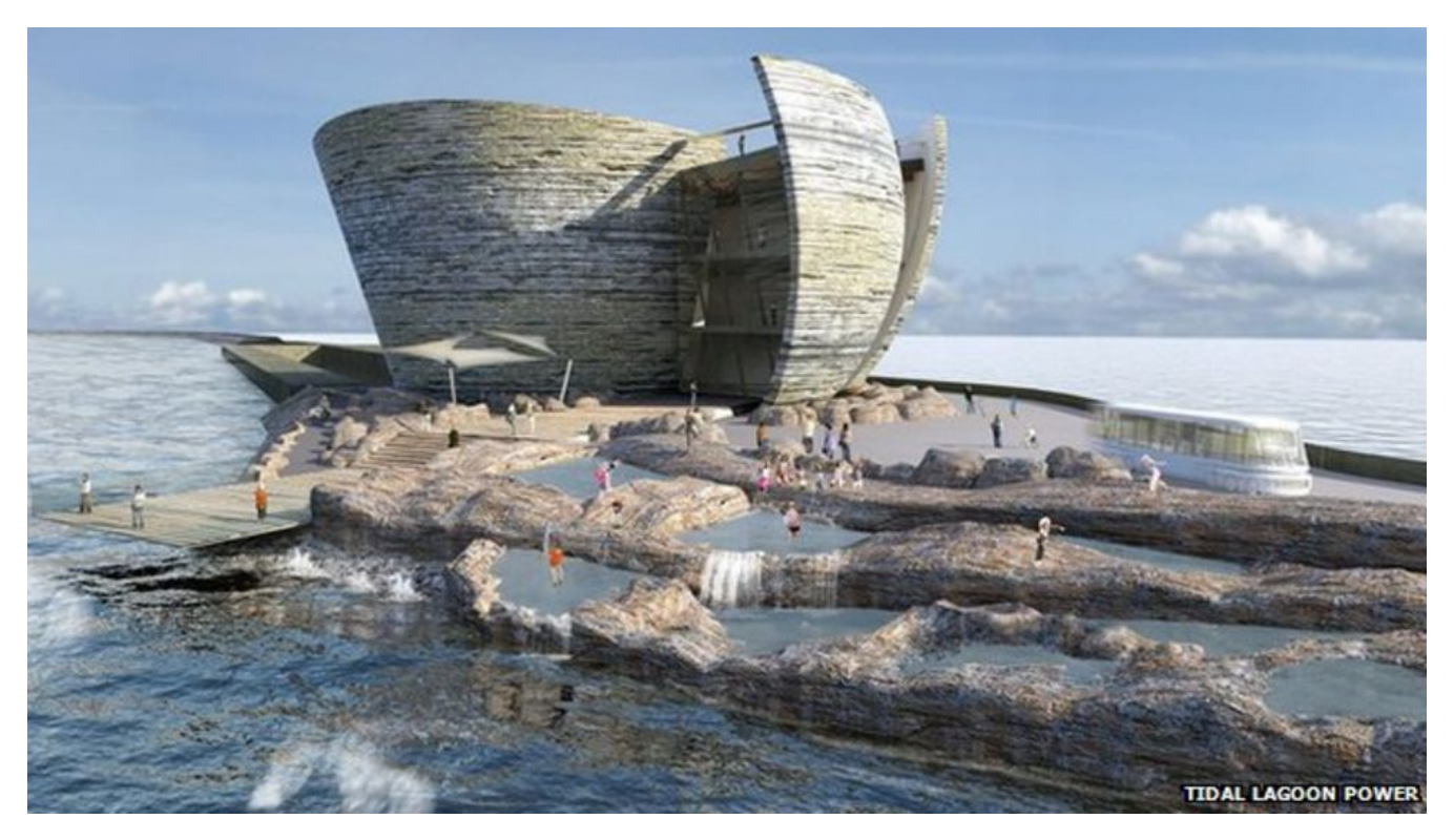
Tidal Lagoon Power

By Roger Harrabin BBC environment analyst