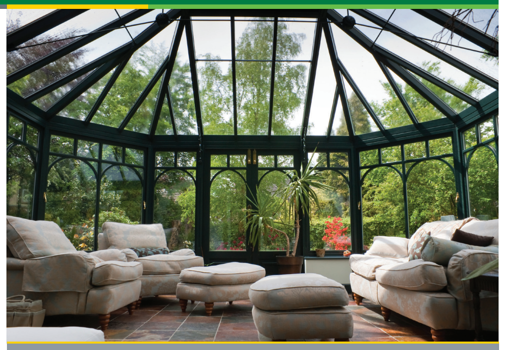
You can apply passive solar design techniques to a new home. However, you can adapt or update existing buildings to passively collect and store solar heat.

Passive solar homes range from those heated almost entirely by the sun to those with south-facing windows that provide some fraction of the heating load.