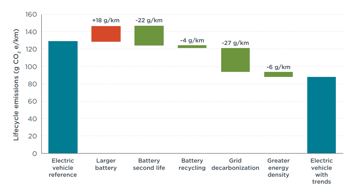
Figure 3. Potential changes in battery manufacturing greenhouse gas emissions (compared to reference 2017 electric vehicle) resulting from increased pack size and improvements in battery manufacturing and use.