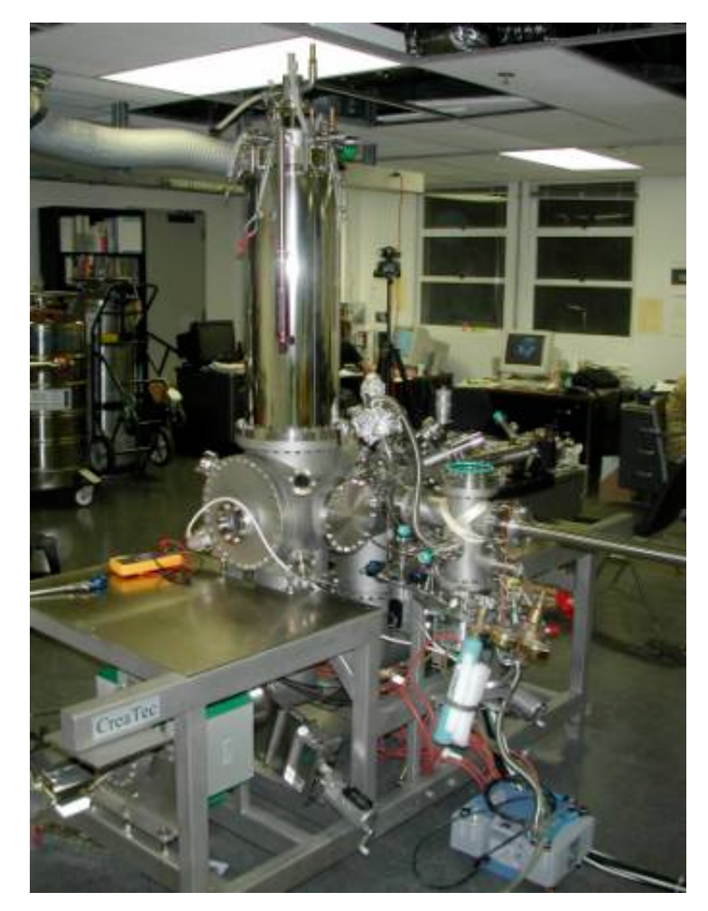
Figure 3. View of a Scanning Tunneling Microscope (STM) at the PICO lab of one of the authors (Gimzewski) at UCLA.

Magnification – On the edge of reality Scientists progressively turned up the magnification, but no matter how good the glass lenses were, how precise the brass tubes and screws were, at around x10, 000, the image goes fuzzier until, at x100, 000, the image is basically blank. This is called "the Raleigh limit", which says you cannot see anything with using a wave that is smaller than half the size of the wave. In other words, this light wave has a size just like an ocean wave has the distance between its crests. The length of the wave is the feature that limits what we "see" which has a limit when we use regular light of two hundred nanometers. It is already twice the size of a wire in a Pentium IV, or a few hundred times thinner than a hair -- it is back to the metric. To get higher magnification, scientists used shorter waves and even the wave properties of electrons. Nevertheless, despite the progress, the high energies and conditions required to make these higher resolution images started to destroy the very objects they wanted to "see". In effect, they ended up looking at matter using something like a focused blowtorch in a vacuum.