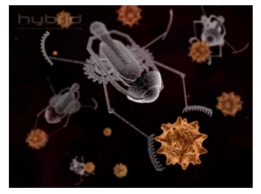
Figure 4. Floating in an aliquot of laboratory test fluid, these hypothetical early medical nanorobots are testing their ability to find and grasp passing virus particles.

Necessity as the mother of invention promulgated the researchers to build a machine where the little needle could be moved across the surface of the oxide film and thereby seek out the pinholes. Thinking about how the new invention worked, led to an important realization scribbled on a lab book. By using electron tunneling as a probe, they realized that mainly the last atom on the needle (the closest on the surface) really sensed the local properties. The needle moving across the surface created a topographic representation, and a few back-of-the-envelope calculations indicated even single atoms could be resolved. What they realized was a major paradigm shift -- rather than using lenses and waves, they were recording by feeling. By 2003, a whole range of microscopes based on tactile sensing had been developed, and many companies were established to manufacture machines that are used by microelectronics and data storage industries. Worldwide sales of these machines are in the range of a billion dollars.