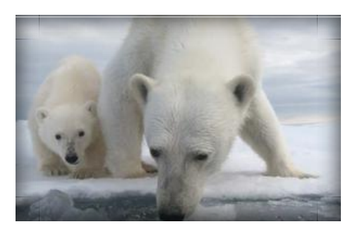
11 species threatened by

Since it was launched in 1990, the Hubble Space Telescope has sent us breathtaking images back from the deepest corners of space