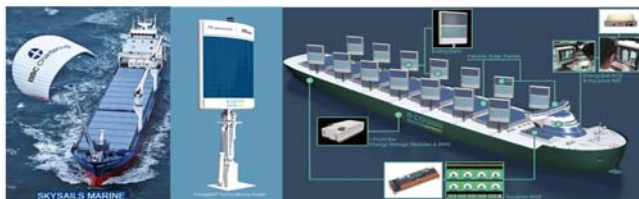
Figure 3. Comparison the SkySails Marine system with EMP’s Energy Sail technology installed on Aquarius Eco Ship. Sources: SkySails [9] and EcoMarine Power [6] websites. Nov.2016.

kite with a rope, a launch and recovery system, and a control system for an automated operation. The system can be installed effortlessly as an auxiliary propulsion system on both newly built and existing vessels harnessing the wind as a cheapest, most powerful, and greenest source of energy on the high seas. The SkySails propulsion system is efficient, safe, and easy to use – and the fact that wind is cheaper than oil makes SkySails one of world’s most attractive technologies for reducing the operating costs and emissions.