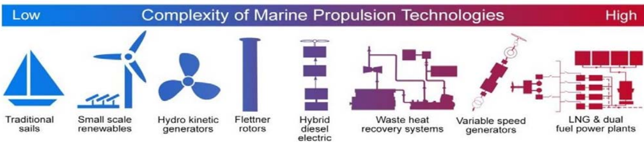
Figure 2. Complexity of Marine Propulsion Technologies.

Keep in mind that around 200 years ago ocean going sailing ships were already reaching speeds of 16 knots or more and carrying goods across the globe without using a drop of oil. Best of all, they also released no harmful emissions or pollution, being always a part of very ecological and environment-friendly sea transportation system (see Figure 1) [4].