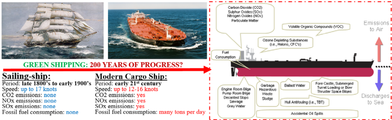
Figure 1. Comparison of the environmental impacts brought by shipping observed in the last 200 years of sea transportation related activities.