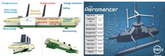
Figure 5. Comparison zero-emission car carrier proposed by Wallenius Wilhelmsen (on the left) with zero-emission Aeromancer system proposed by Inerjy (on the right). Sources: Wallenius Wilhelmsen [10] and Inerjy [7] websites. Nov. 2016.

There is also another quite interesting green technology proposed by Wallenius Wilhelmsen [10] for zero-emission car carrier (see figure 5) with length overall 250 m, height 30 to 40 m, beam moulded 50 m, design draught 9 m, design speed 20 knots (maximum) and 15 knots (in service), vehicle capacity 10000 cars (based on today's standard units) with design cargo deck area 85000 m 2 and eight cargo decks, of which three are adjustable in order to accommodate high and heavy vehicles and equipment.