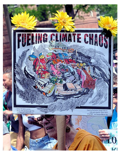
Placard against fossil fuel transports, at the People's Climate March (2017).

Environmental regulations in developed countries have reduced the individual vehicle's emission. However, this has been offset by an increase in the number of vehicles, and increased use of each vehicle (an effect known as the Jevons paradox).<sup>[1]</sup> Some pathways to reduce the carbon emissions of road vehicles have been considerably studied.<sup>[3]</sup> Energy use and emissions vary largely between modes, causing <u>environmentalists</u> to call for a transition from air and road to rail and human-powered transport, and increase <u>transport electrification</u> and <u>energy</u> <u>efficiency</u>.