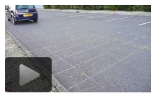
Road traffic contributes to seed dispersal. How this compares to baseline dispersal in the habitat replaced by the roadway varies depending on the ecosystem.