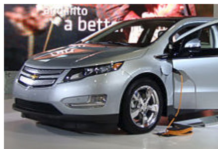
The Chevrolet Volt operates primarily as a series hybrid.

This is a series-hybrid arrangement and is common in diesel-electric locomotives and ships (the Russian river ship Vandal , launched in 1903, was the world's first diesel-powered and diesel-electric powered vessel) and Ferdinand Porsche successfully used this arrangement in the early 20th century in racing cars, including the Lohner-Porsche Mixte Hybrid . Porsche named the system System Mixte, which had a wheel hub motor arrangement, with a motor in each of the two front wheels, setting speed records.