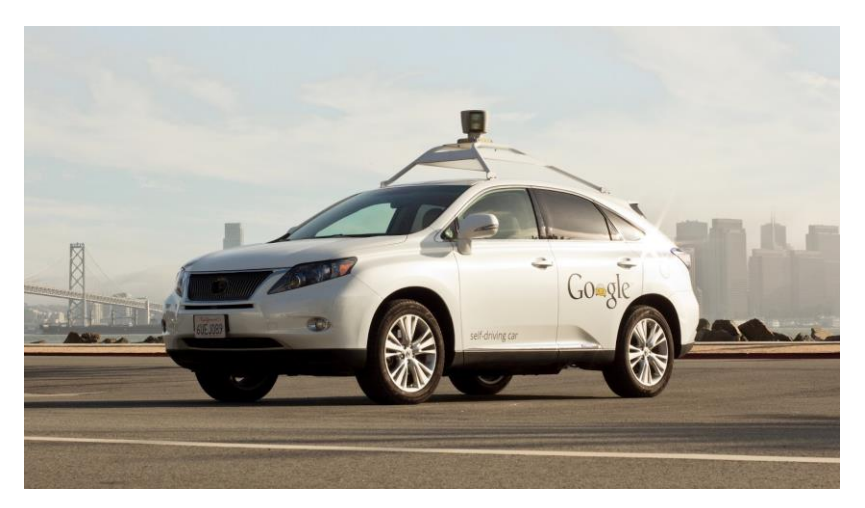
Exhibit 2: Google Driverless Car

Level 4 vehicles would require no human driver for operation and indeed could operate without any occupants. Networks of shared, taxi-like AVs with intermediate trips by unoccupied vehicles would require AVs of Level 4 capability. As of 2014, no Level 4 vehicles exist. Estimates of when they would be developed range from 2025 to 2050. Possible adoption timelines are discussed further in Section 2.