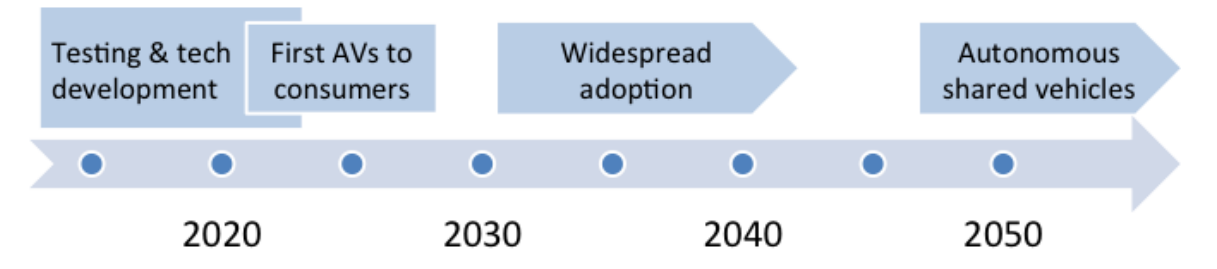
Exhibit 3: Potential AV Adoption Timeline

Adoption of alternative fuel vehicles such as hybrids and plug-in electrics can provide an interesting analog. Development of these vehicles dates back to the early 1990s. The first hybrid models, such as the Toyota Prius were introduced in the U.S. in the early 2000s at a significant cost premium and supported by generous tax incentives. Hybrid ownership grew slowly but has accelerated in recent years. By 2013, there were nearly 600,000 hybrids in California, or approximately two percent of California vehicles (Reese 2013). The analogy between hybrids or EVs and AVs should not be over-stressed. However the